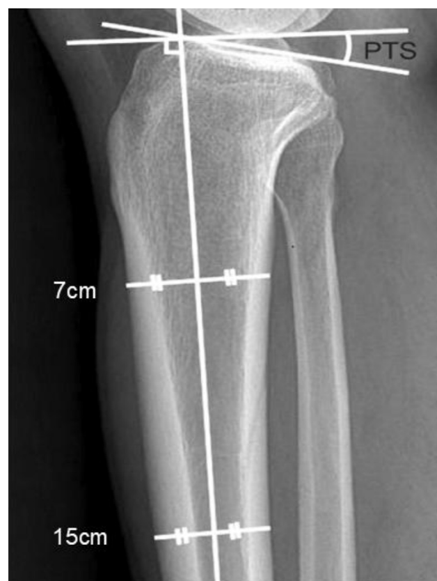
Fig. 1. Posterior tibial slope measurement using digital lateral radiographs.

A 5.5 mm shaver (Tomcat, Stryker Endoscopy, San Jose, CA) was used